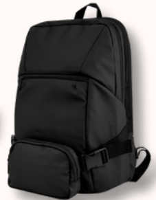
Optional Imprint Area