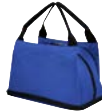
Collapsed Bottom Compartment